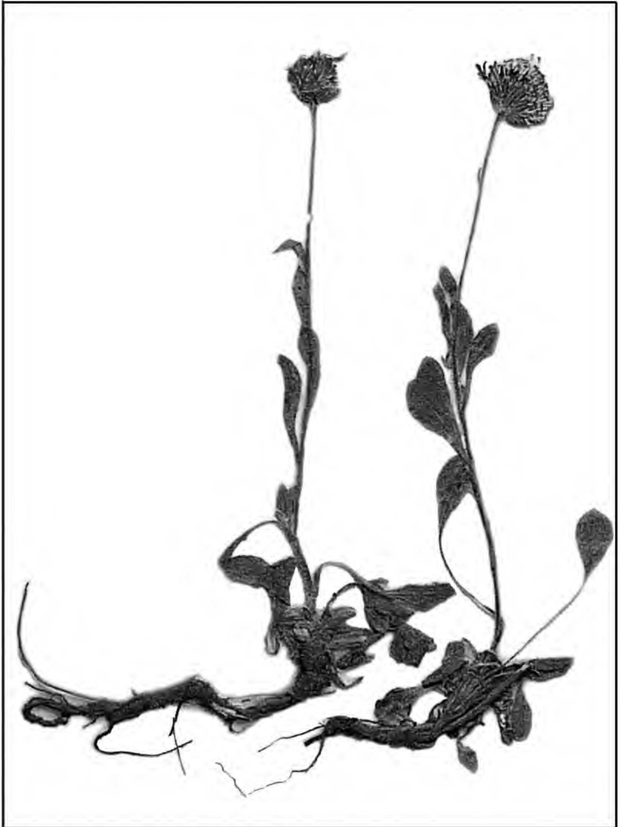
Figure 3. Close-up of plants from Porter 1166 .